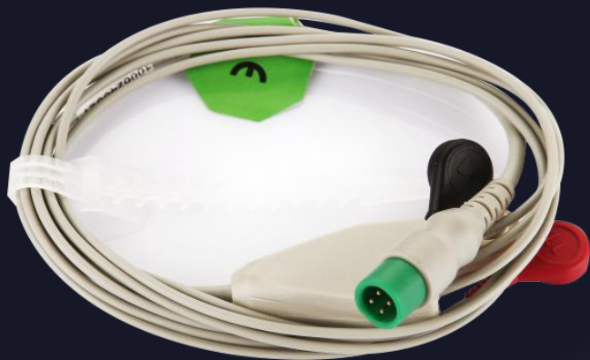
3-lead Snap Connector ECG Cable