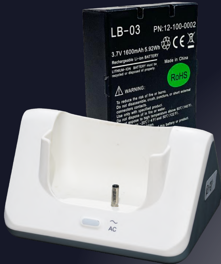
LB-03 Lithium battery + charger stand