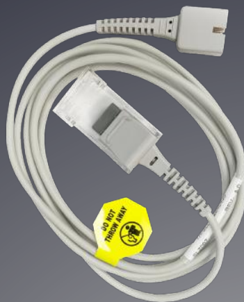
SpO2 extension cable