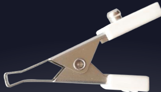
ECG alligator clip Electrodes