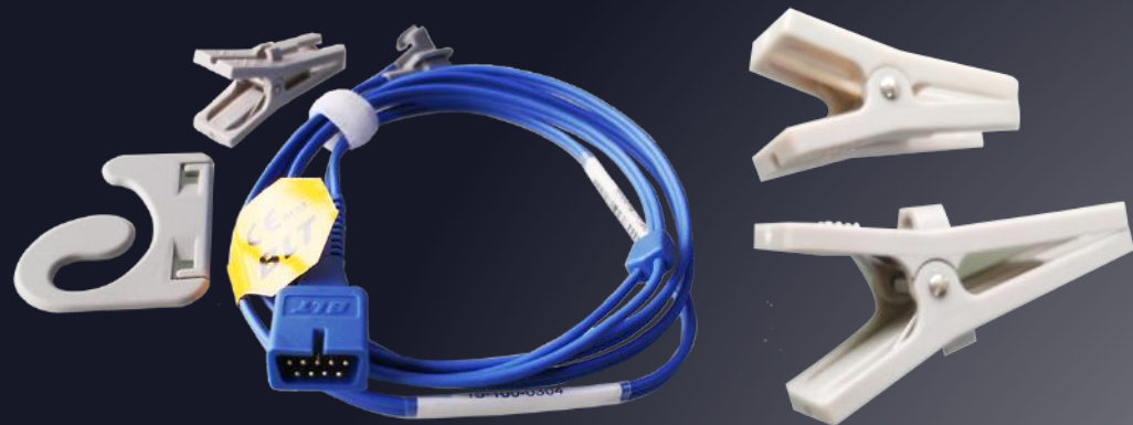
BLT digital SpO2 ear clip reusable sensor +tongue clip