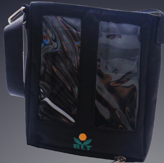
M800 Vet Carry bag